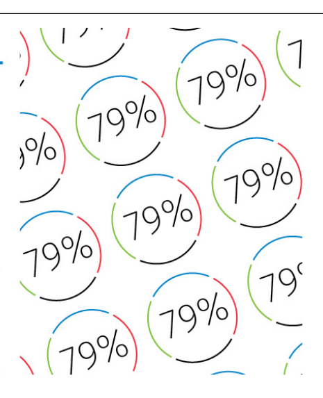
2022 SURVEY REPORT The Wolters Kluwer Future Ready Lawyer Leading change

Experience how the renewed Manual IP enables you to work more efficiently