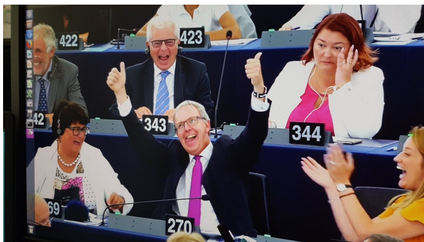
EP Rapporteur Axel Voss reacting to the adoption of the EP negotiation position on 12-9-2018

This introduction of an independent obligation to protect legitimate uses was crucial to create the majority support needed for the European Parliament to adopt its negotiation position in September 2018. In the subsequent trilogue negotiations, the approach contained in the European Parliament's report prevailed over the approach contained in the Council's position and the Commission's original proposal. In other words, during the legislative process leading to the adoption of the DSM directive, EU legislators twice chose an independent obligation to protect legitimate uses over proposals to protect legitimate uses by way of an