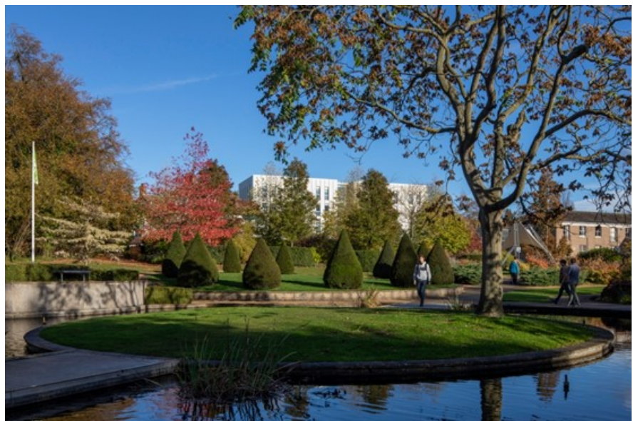
View of the Monica Partridge Building from the Millennium Gardens, University Park